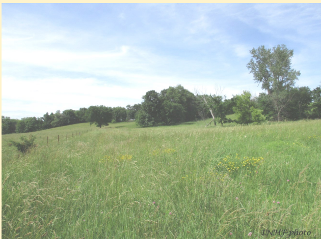
INHF Indiangrass Hills conservation area