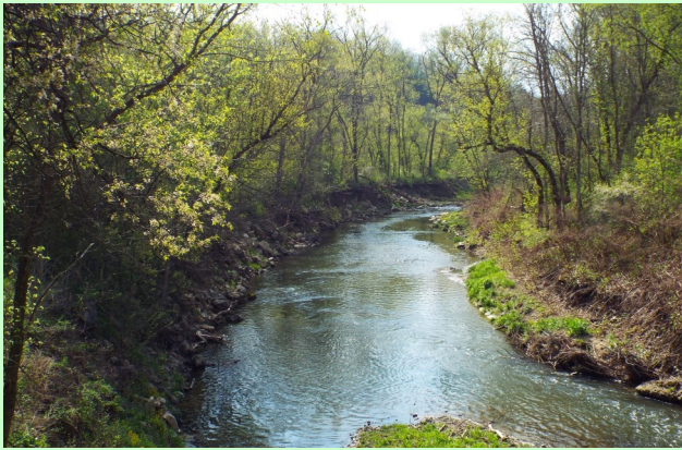
Paint Creek 368-acre addn. to Yellow River State Forest